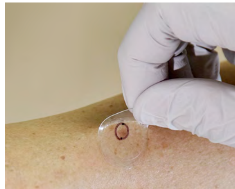
Fig 1. Noninvasive adhesive patch skin biopsy.

‡ Includes seborrheic keratosis, lentigo simplex, basal cell carcinoma, and fibrosis.