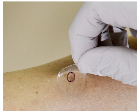
Fig 1. Noninvasive adhesive patch skin biopsy.

‡ Includes seborrheic keratosis, lentigo simplex, basal cell carcinoma, and fibrosis.